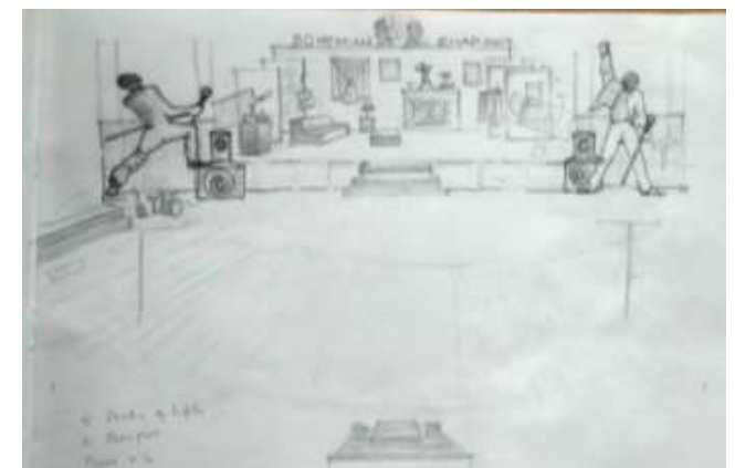
A DRAWING OF THE STAGE BY THE ART DEPARTMENT