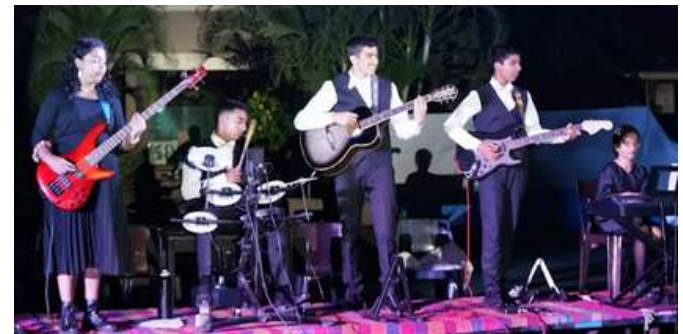
THE BAND MEMBERS OF THE CONCERT