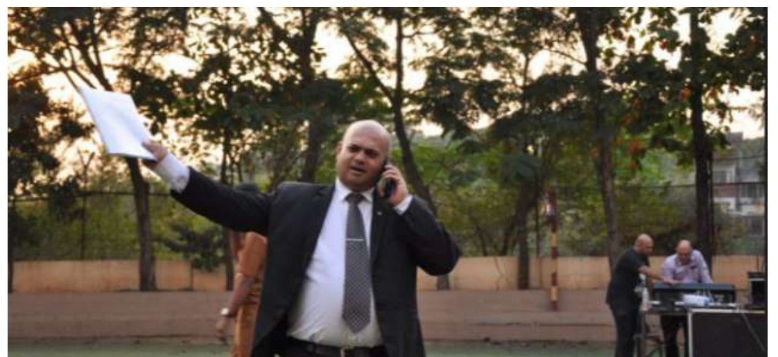
ON THE SETS OF THE SHOW MUST GO ON

He had faith that the bulk of the crowd, who had grown up listening to Queen, would find the concert appealing, and they did. Music, dance, and theatre were all perfectly incorporated. He just has one final piece of advice for the class that will graduate this year: "Never forget where you belong."