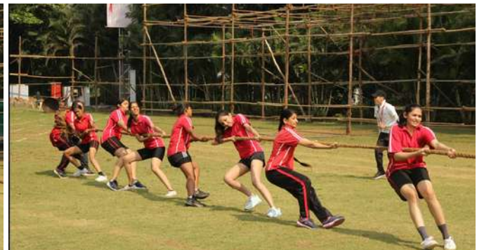
THE TUG OF WAR WAS CONDUCTED ON NOVEMBER 19TH, 2022. COOPER WON THE BOYS, WHILE FREEZE WON THE GIRLS COMPETITION.